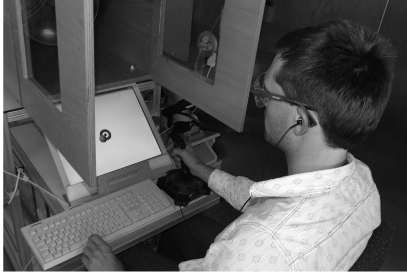
Figure 1: The first author demonstrating the simultaneous visual vigilance and tracking test (VTT) and auditory vigilance test (AVT); the screen shows the VTT.

of the screen. During the trials the subject was the only person occupying the chamber and did not have any contact with the outside. More details on this setup can be found elsewhere [5].